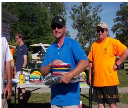
More plastic for winners!